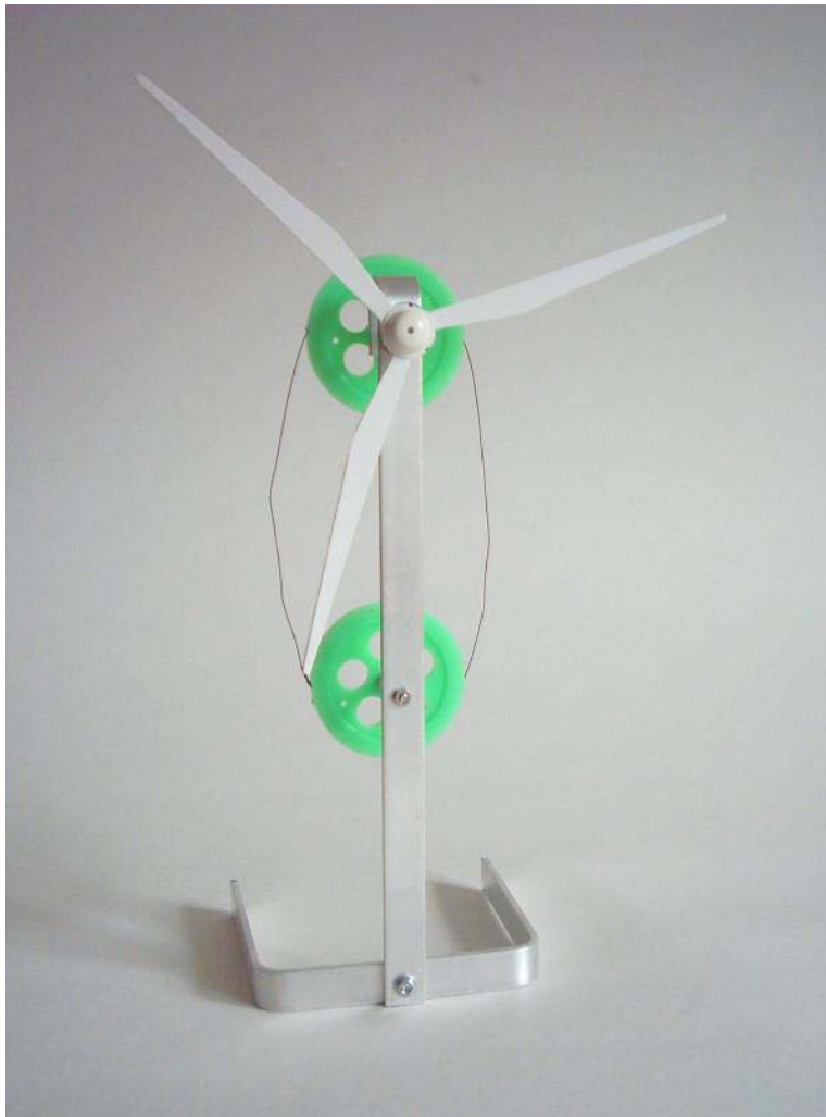
Memory Metal Engine